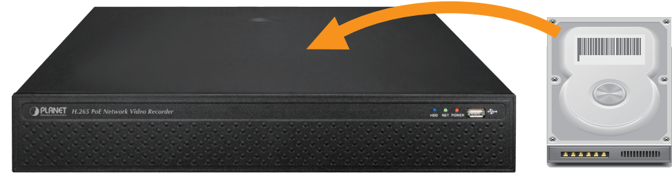
Provides scalability up to 32TB